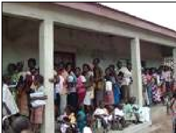
Taking supplies into the school.