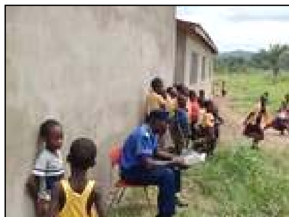
Having a well-earned rest.