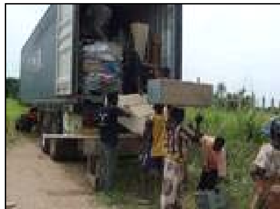
Unloading the container of furniture.